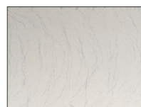
COVERAGE TOO LIGHT