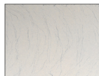
COVERAGE TOO LIGHT