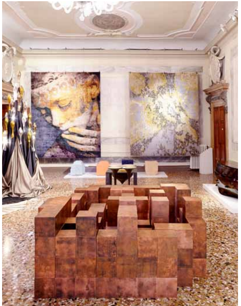
The Venice Biennale for Architecture 2016