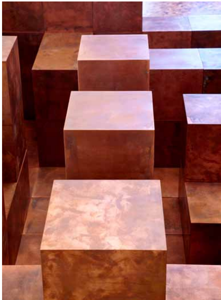
The Venice Biennale for Architecture 2016