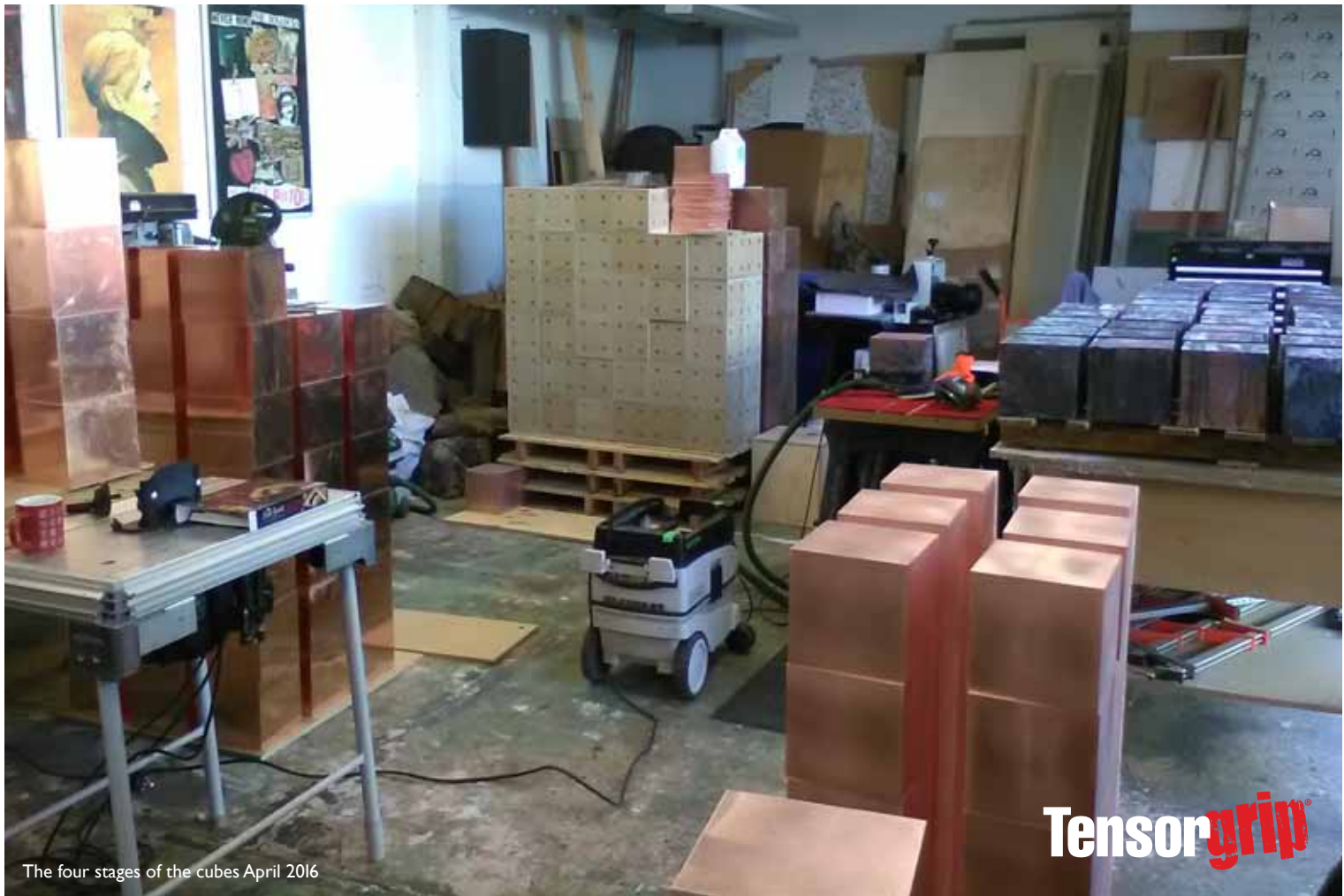
The four stages of the cubes April 2016