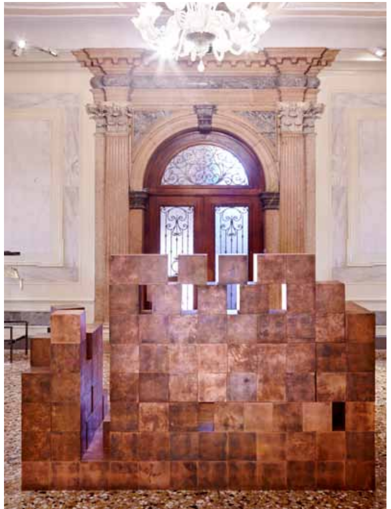
The Venice Biennale for Architecture 2016